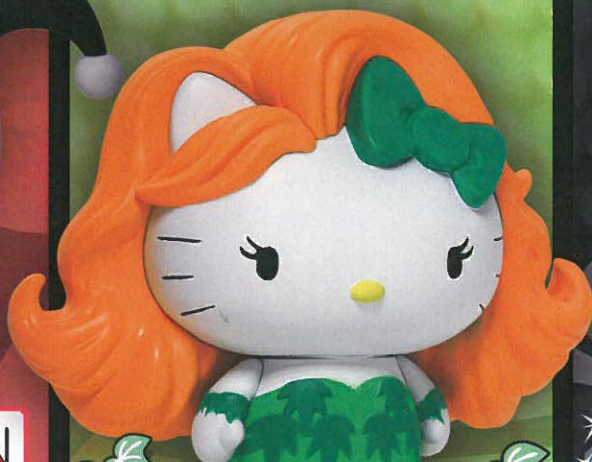
POISON IVY HELLO KITTY