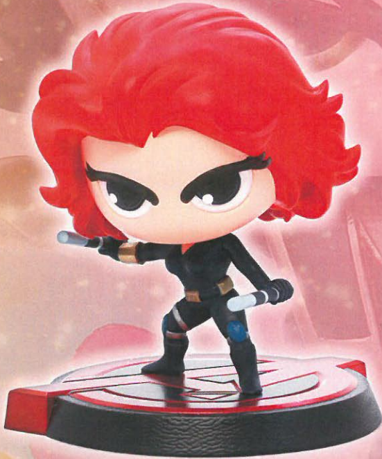
36019 BLACK WIDOW

Final product may slightly vary from the pictured sample