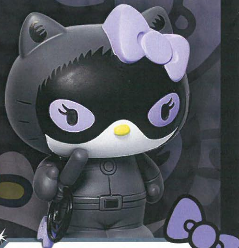
CATWOMAN HELLO KITTY