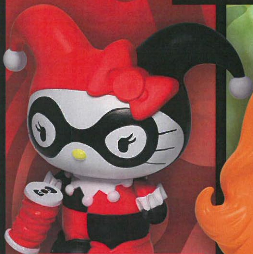
HARLEY QUINN HELLO KITTY