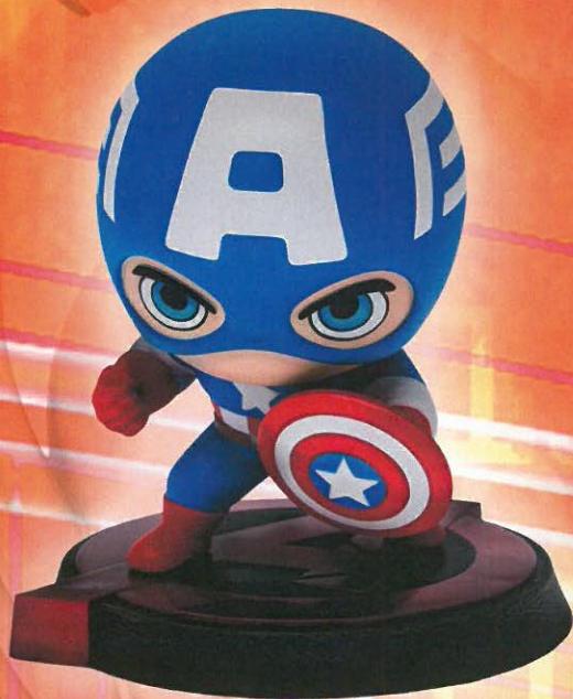
36012 CAPTAIN AMERICA